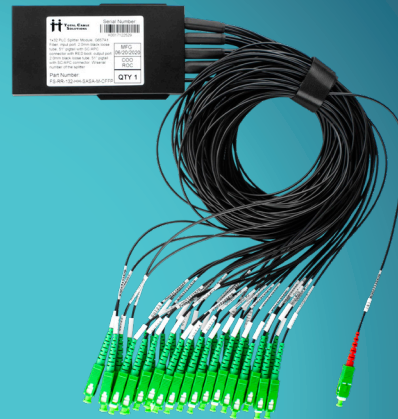
Designed for Charles Industries CFFP (CFSM-PP Compatible)**