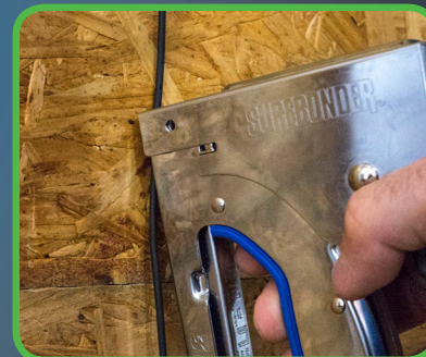
Secure 1 meter of cable with 20 staples on a wood panel